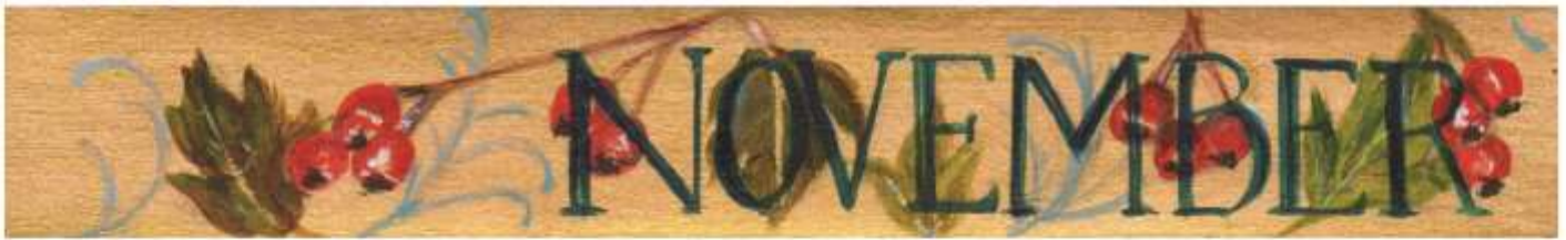
Illustration - Amanda Brookes