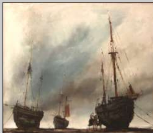
Three Rowles on the Beach

www.modbury-preschool.org modburypreschool@hotmail.co.uk 01548 831477