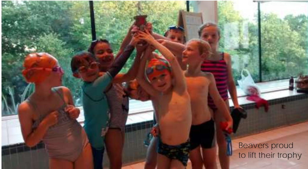
Beavers proud to lift their trophy

The young people swam widths and lengths, raced to collect balls, carried a tray of drinks across the pool and rescued damsels in distress. There were swimmers from Modbury in every race and all their hard work paid off. As overall winners, both Beavers and Cubs brought home big shiny trophies as a result of being placed 1st, 2nd or 3rd in almost all the races! Fantastic fun all round, and well done to everyone who swam on the day.