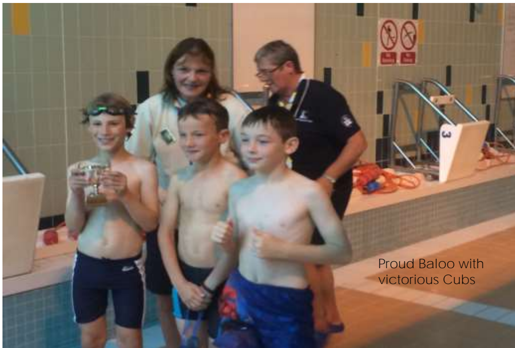
Proud Baloo with victorious Cubs

The young people swam widths and lengths, raced to collect balls, carried a tray of drinks across the pool and rescued damsels in distress. There were swimmers from Modbury in every race and all their hard work paid off. As overall winners, both Beavers and Cubs brought home big shiny trophies as a result of being placed 1st, 2nd or 3rd in almost all the races! Fantastic fun all round, and well done to everyone who swam on the day.